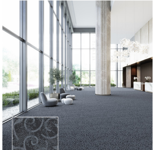
780 / Zen Design Tradition / Steel